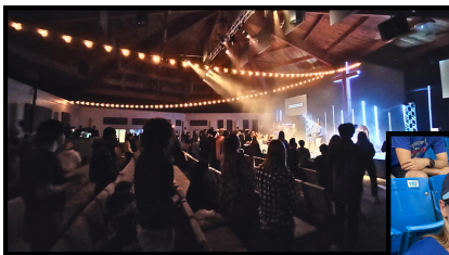
Students leading & participating in worship at ONE Night - Feb. 7 2024

The time we have with these teens is a privilege and a gift. The transformation we see isn't always instantaneous – often, it feels like a slow process – but as I continue to pray for these kids, who I love so much, I have confidence that God will complete the good work he's started in them. If it's not good, God's not done!